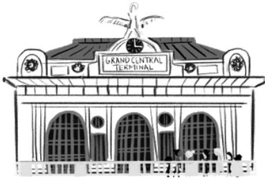
Grand Central Station